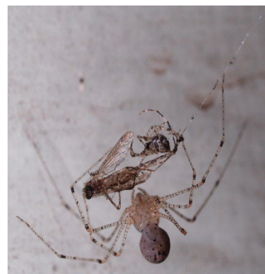
Fig. 1. A juvenile S. atlacoya wrapping a juvenile P. tepidariorum (top right) that had been attracted by the former's plucking of the latter's web. (The mosquito blundered into the wrapping scene, and was subsequently eaten.)

Two of the female hatchlings from eggs that had rolled out of the egg sac survived to