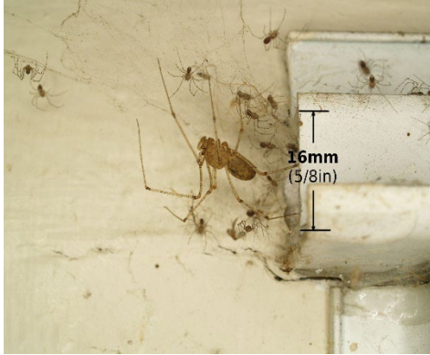
Fig. 3. Adult female S. atlatocoya and some of her offspring hunting outside their daytime retreat.