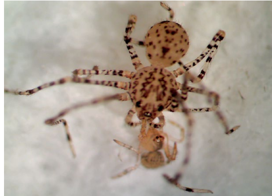
Fig. 2. Deformed 2 nd instar S. atlacoya eating freshly killed 2 nd instar P. tepidariorum . Author can provide video from which this still photo was taken.