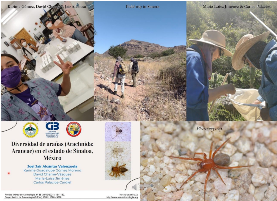
Fig. 1-6. Scytodes lugubris : 1, 3. Prosoma, vista dorsal. 2, 4. Opistosoma, vista dorsal. 5. Vulva, vista dorsal. 6. Detalle de la vulva, vista dorsal. 1-2, 5-6. Hembra, forma clara. 3-4 Hembra, forma oscura. Escalas: 1-4; 1,0 mm; 5; 0,5 mm; 6; 0,1 mm. Abreviaturas: ES, espermática, sc, escutula.