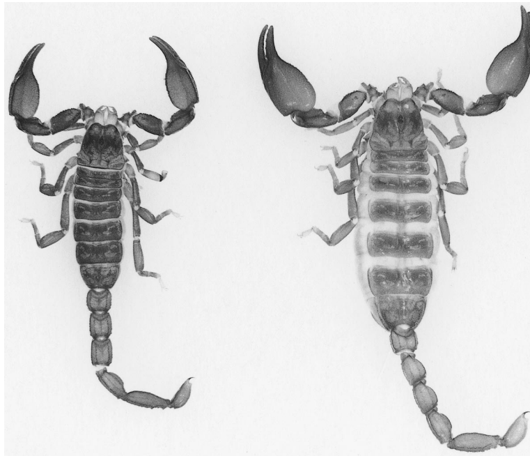
Figure 1.— Diplocentrus lindo , adult male paratype (left) from 5 mi. N of Sanderson, Terrell County, Texas, USA, and adult female paratype (right) from 0.5 mi. S of Langtry, Val Verde County, Texas, USA, dorsal aspect.