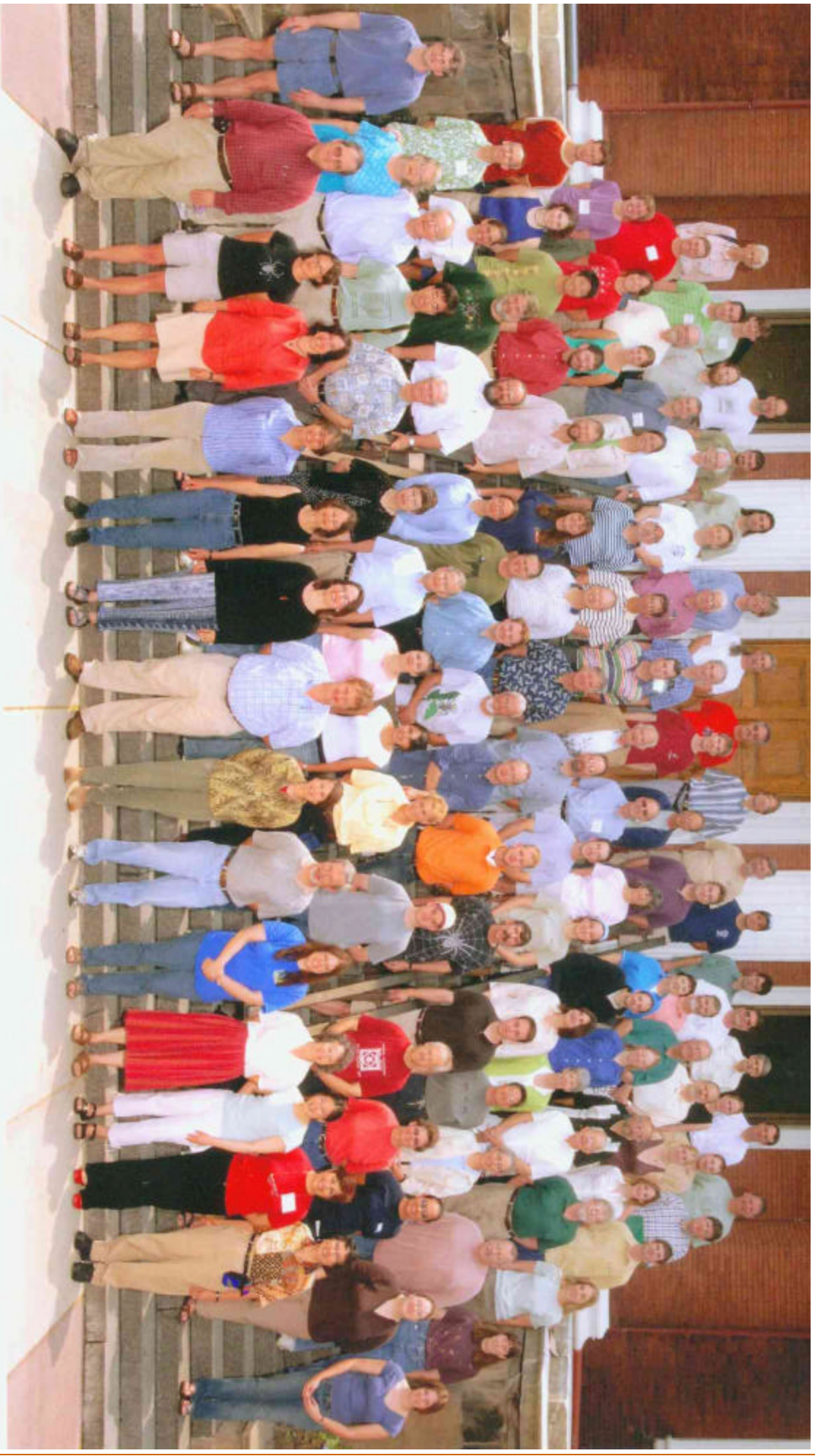
American Arachnological Society 2005