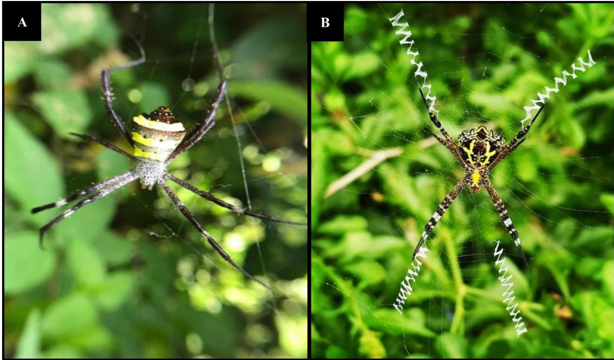
Supplemental Figure S1.— Argiope anasuja female in the Western province of Sri Lanka, September 2021, (A) dorsal view and (B) ventral view.

The natural history of Argiope anasuja (Araneae: Araneidae) with special reference to their mating behavior. Journal of Arachnology 52(X):xx-xx