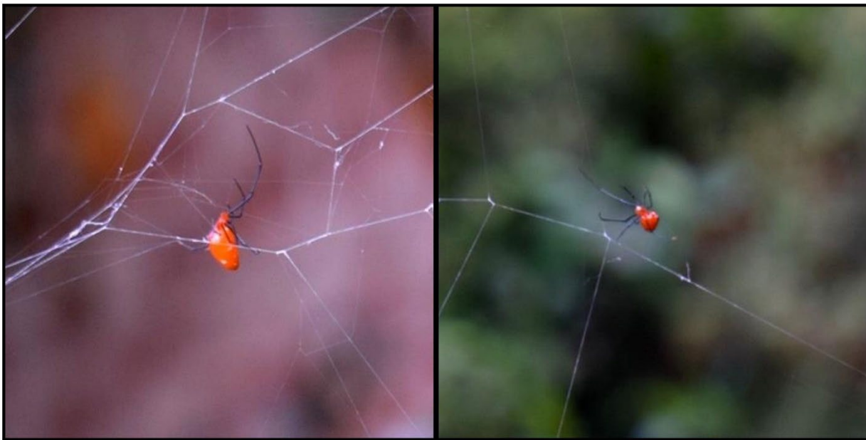
Supplemental Figure S5.— Argyrodes flavescens kleptoparasites on the webs of female A. anasuja , Waradala, Srilanka 2021.