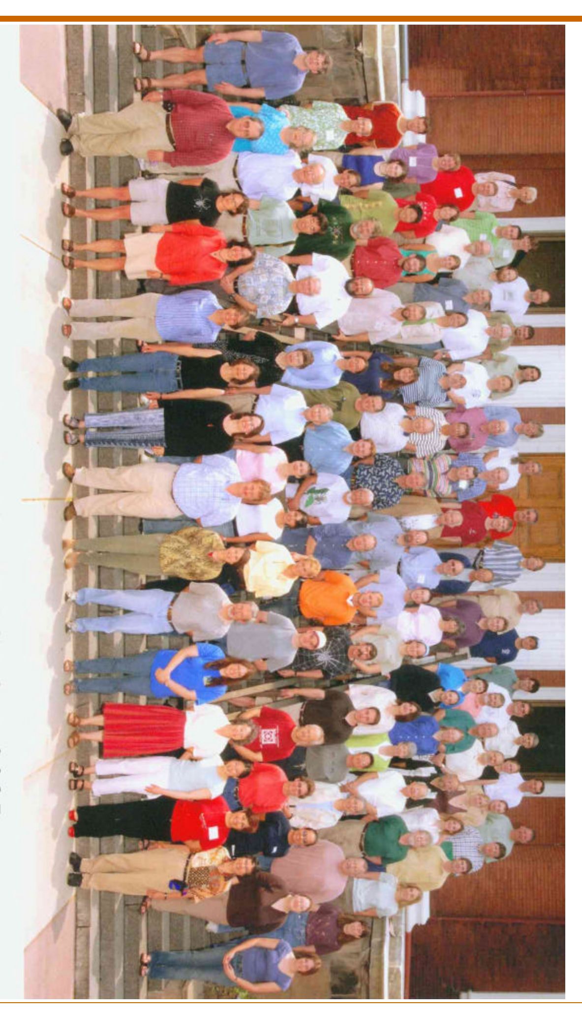
American Arachnological Society 2005