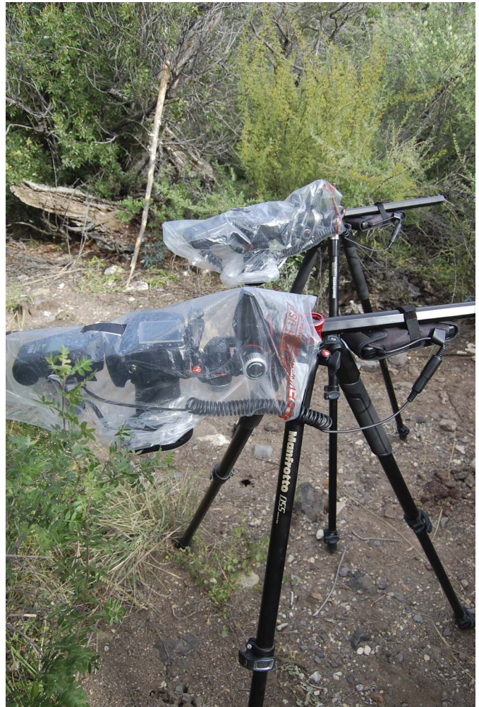
Figure 2.—Camera set-up over nests of Novomessor albisetosus ; field of view includes main nest entrances as well as an extensive area surrounding the nest entrance (approximately 0.152 m 2 covered by each camera).

The similarity in color, size, and eye reflectance of the spider photographed October 12 th and M. chihuahuensis (compare Fig. 3 with Fig. 4) is compelling. The adjacency of the photographed spider with ants, particularly dead ants, also strongly suggests this to be M. chihuahuensis . The fact that the spider never left the vicinity of the nest entrance; was not photographed away from the entrance, despite five nights of filming and nearly 4000 images surveyed; was