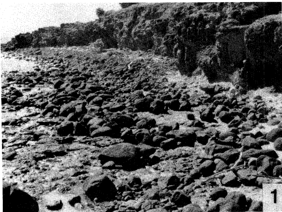
Figure 1.—Type locality of Paratheuma makai , beach at Kapaa, Kauai, Hawaii.

Four adults of each sex were measured. Total length was measured from anterior carapace margin (or anterior eye margin when eyes projected beyond carapace) to the base of the spinnerets. Some specimens from Kauai were reared