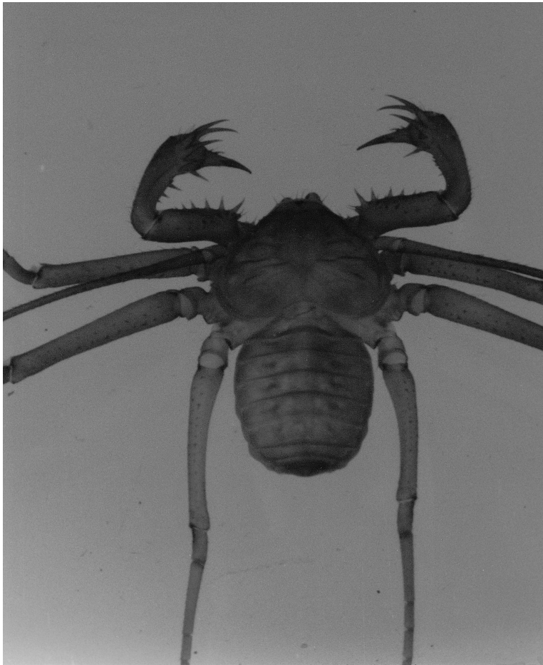
Figure 1.—Dorsal view of Charinus ioanniticus female, from El-Mallahat near Burg El-Arab, Egypt.

terranean region is represented by Charinus ioanniticus (Kritscher 1959) which has been reported from Greece, Israel and Turkey (Kritscher 1959; Kraus 1961; Weygoldt 1972; Kovařík & Vlasta 1996). Among an arthropod collection from the