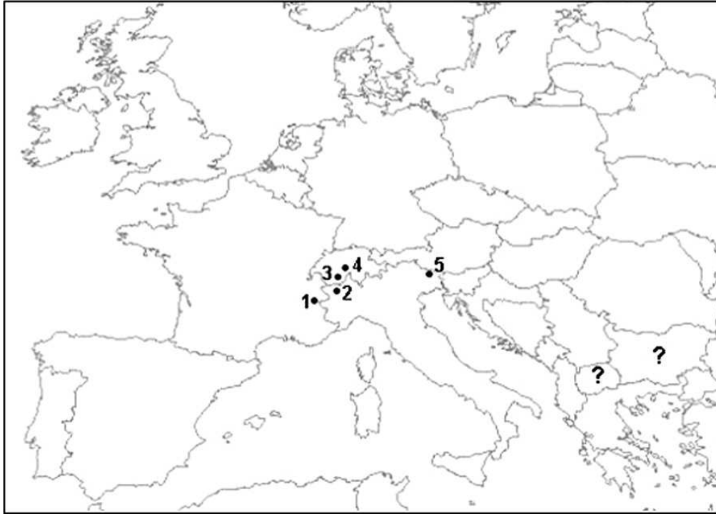
Figure 5.—Distribution—of Berlandina nubivaga (Simon 1878); dots refer to known localities. 1. F - Hautes Alpes, Col de l'Echelle; 2. I - Aosta Valley, Torgnon; 3. CH - Wallis, Saas- Fee; 4. CH - Wallis, Fiesch; 5. I - Province of Udine, Forno Avoltri; (1 after Simon 1878; 3, 4 after Grimm 1985; 5 after di Caporiacco 1926). Question marks refer to doubtful records in Macedonia and Bulgaria (see text).

Pesarini (1995), di Franco (1997), and Trotta (2005) supposedly after the records published by Caporiacco (1926) who identified one female and one male (not described) from Carnic Alps (province of Udine, Forno Avoltri, ric. Marinelli, elev. 2122 m). This material was unfortunately not checked by us nor by Grimm (1985). The species is also recorded for Bulgaria (Drensky 1915, 1936 in Deltshv & Blagoev 2001) and Macedonia (Nikoliæ & Blagoev 2002, in Blagoev 2002). Literature records referring to B. nubivaga from Bulgaria (Drensky 1915, 1936; Nikoliæ & Polenc 1981) are unverifiable. A section of the Museum and a part of the Drensky's collection in which the assumed specimens of B. nubivaga were stored, were destroyed during the war (Deltshv 2007, pers. comm.). According to Deltshv (2007 pers. comm.), B. nubivaga does not occur in the Balkan Peninsula, and relevant misidentification is found in Drensky's collection. The same doubtful situation concerns B. nubivaga in Macedonia, for which no material is available. Deltshv's opinion is shared by T. Blick (2007, pers. comm.) who asserts that the only sure data are those from the western Alps. The record by Caporiacco (1926) from the eastern Alps seems to be plausible (Pantini 2007, pers. comm.) but needs confirmation. All in all, present reliable data seem to suggest that the distribution of B. nubivaga is restricted to the Alps. However, more records are needed to sustain this hypothesis.